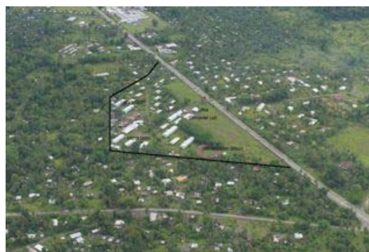
The site of Balob Teachers College has been the selected property that is proposed to house auxiliary functions of the Lutheran University of Papua New Guinea.

The sites of Martin Luther Seminary and Balob Teacher's College are being studied as to how the properties can be best used to develop the new Lutheran University. A proposed placement of new infrastructure follows on page 4 .