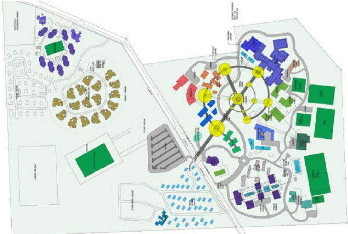
Proposed plans show dormitories and residential areas on the north side of Busu Road and offices, lecture halls, and sports fields on the south side of Busu Road on the Martin Luther Seminary Site. Further revised plans are expect by mid November. (Peddle Thorp Architects and Infratech Management Consultants)

Water and ponds will also be used throughout the University to act as parts of the storm-water system or to act as uplifting visual and noise backgrounds to spaces with the use of fountains.