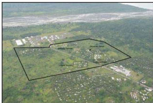
The site of Martin Luther Seminary has been the selected property that is proposed to house most functions of the Lutheran University of Papua New Guinea.

The Lutheran University is currently working with Infratech Management Consultants to develop a Master Plan to guide the current and future infrastructure of the University. The Master Plan development is ahead of schedule and the University hopes to be able to share the completed plans within the next month.