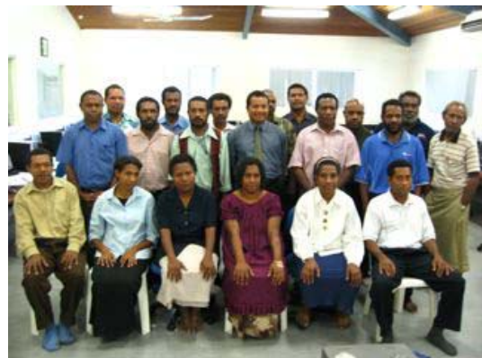
Twenty-three lecturers from Balob teachers college selected to receive an advance degree sponsored by LUPNG.